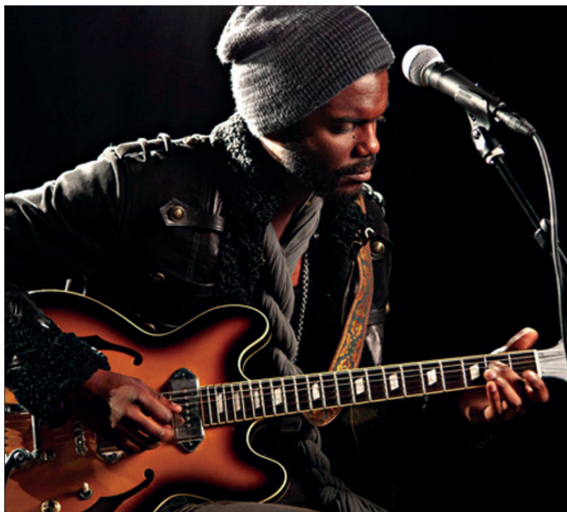
Gary Clark, Jr.

toured the world multiple times, won a Grammy, played with everyone from the Foo Fighters to the Rolling Stones, got engaged to model Nicole Trunfio and became a dad.